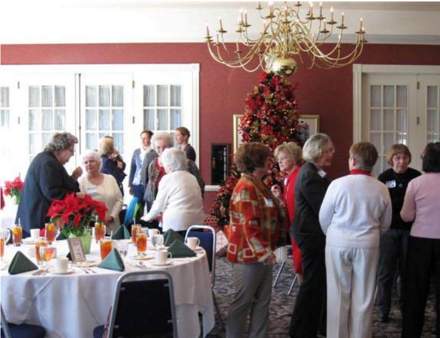
Members gather to catch up with each other at the branch holiday luncheon held December 1 at the River Bend Country Club