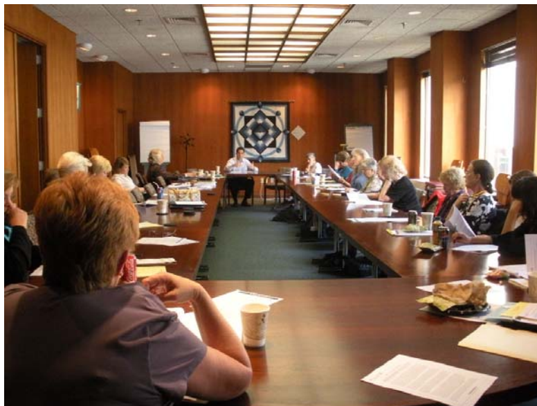
Lobby Corps members and guests listen to updates on AAUW’s public policy priorities