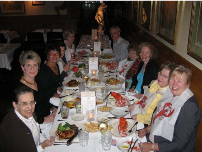
Branch members and guests enjoy Dining Out at Clydes' Lobster Fest in October.